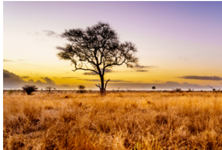
Sunrise in Kruger National Park, South Africa