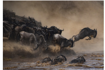
Wildebeest migrating across Tanzania and Kenya, in pursuit of food