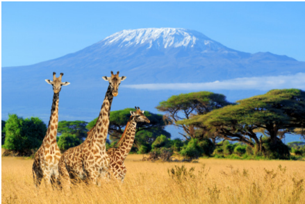
Giraffes near Mount Kilimanjaro in Kenya

3. Using the images below and your knowledge organiser, write a description of what the savanna is like.