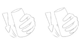
DOWN TAP Tap the base of the cup on the table