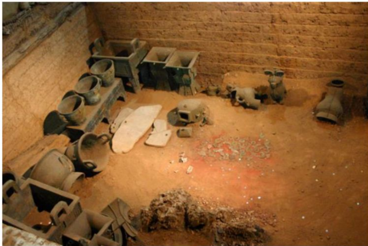
The tomb of Fu Hao, wife of Emperor Wu Ding.