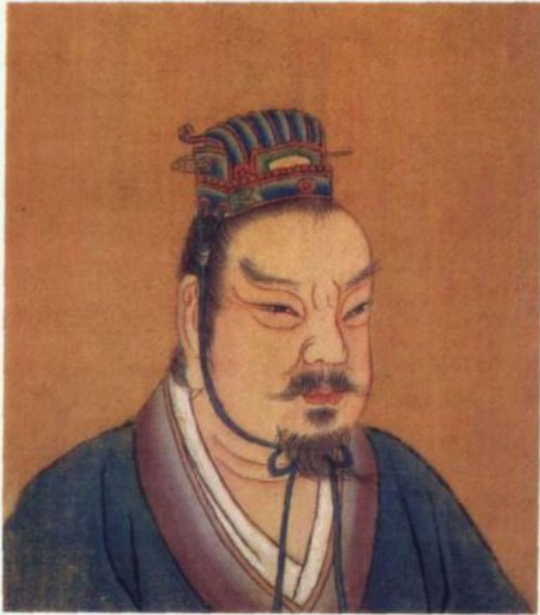
武丁 (? - 前1191) 清人绘