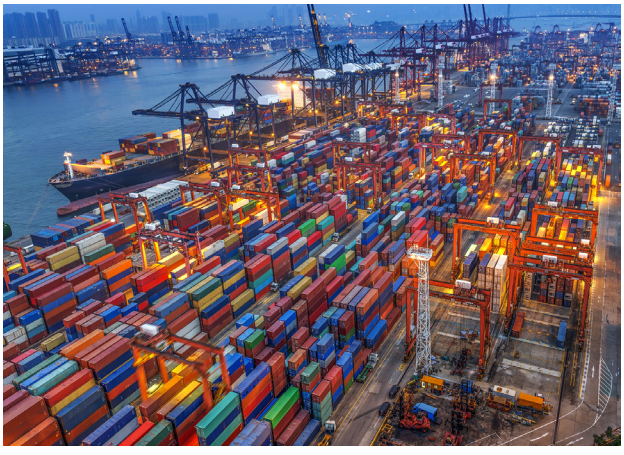
Photo: Containers waiting to be loaded onto ships in Singapore and then transported around the world.

5. Why do you think the development of transport systems has helped facilitate globalisation?