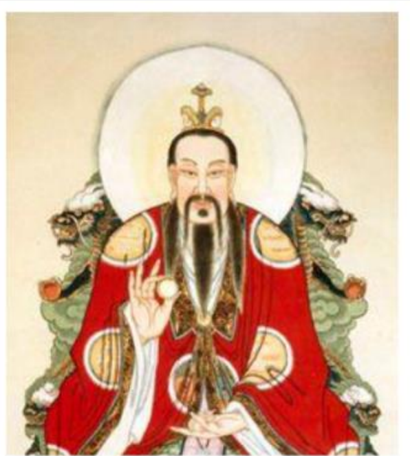
A portrait of Shangdi