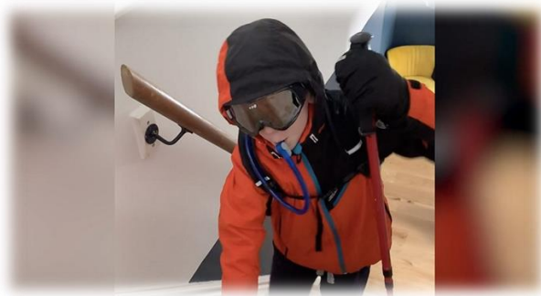
A member of the Cub group climbs their stairs as part of the tiring attempt

Yesterday, a group of Cubs completed a challenge to climb Mount Everest by climbing their stairs as part of a 'stay at home' challenge.